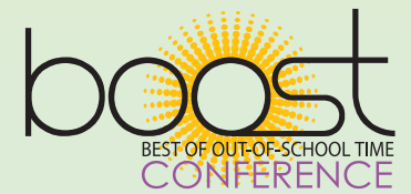
EXHIBIT DATES: APRIL 29-30, 2010 • PALM SPRINGS CONVENTION CENTER - OASIS 3A-4 • PALM SPRINGS, CA